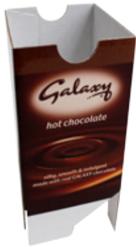
An example of packaging printed by Swanline.