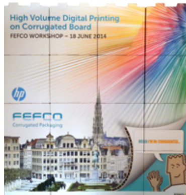
A wall made of boxes digitally printed by ESKO for the workshop.